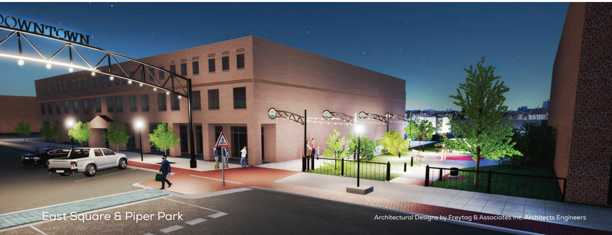
East Square & Piper Park

Architectural Designs by Freytag & Associates Inc. Architects Engineers