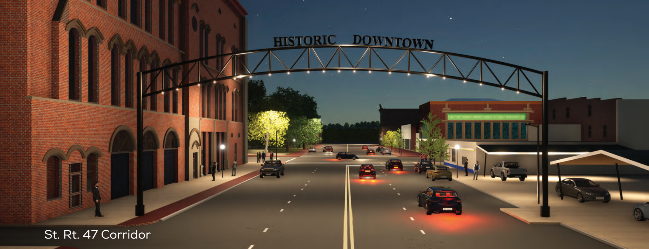
St. Rt. 47 Corridor